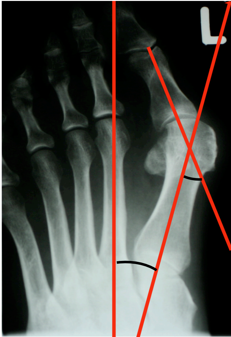
X-Ray without Hallux-splint

Intermetatarsal angle: 16 ° Hallux valgus angle: 40 °